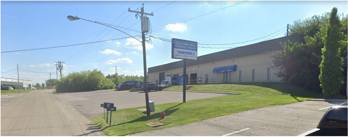
Northbound on North Garver Road