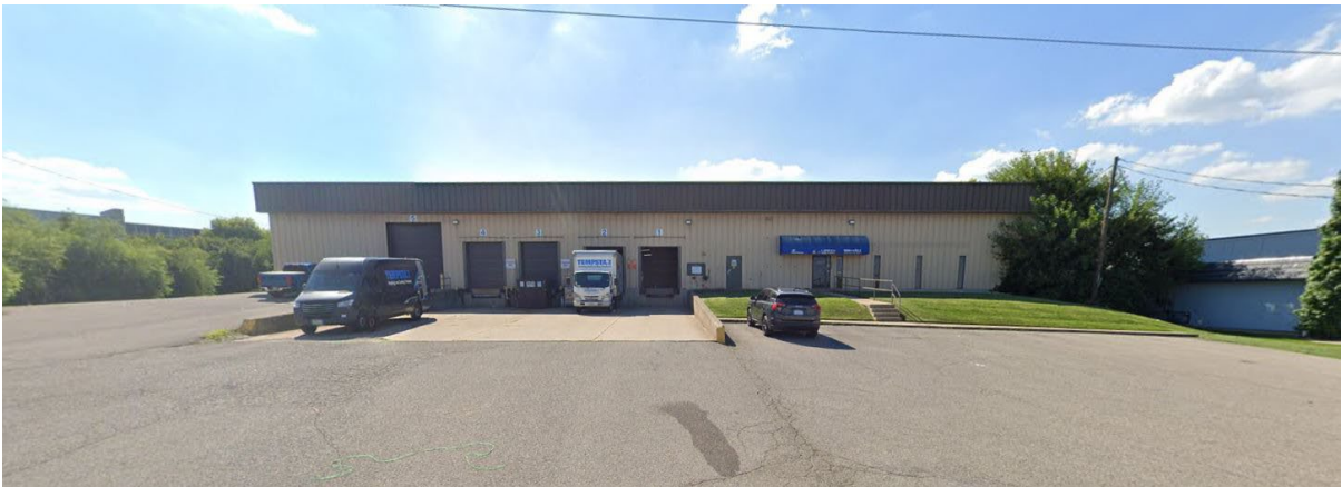
Southbound on North Garver Road